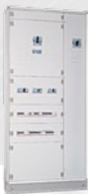
FOR SITES UP TO 800 A